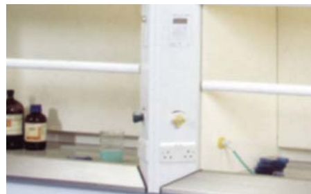
Electric sockets & lab gases

Assured performance, and proven reliability are just a few of the features of the Safety Cabinet Solution Fumair range of fume cupboards.